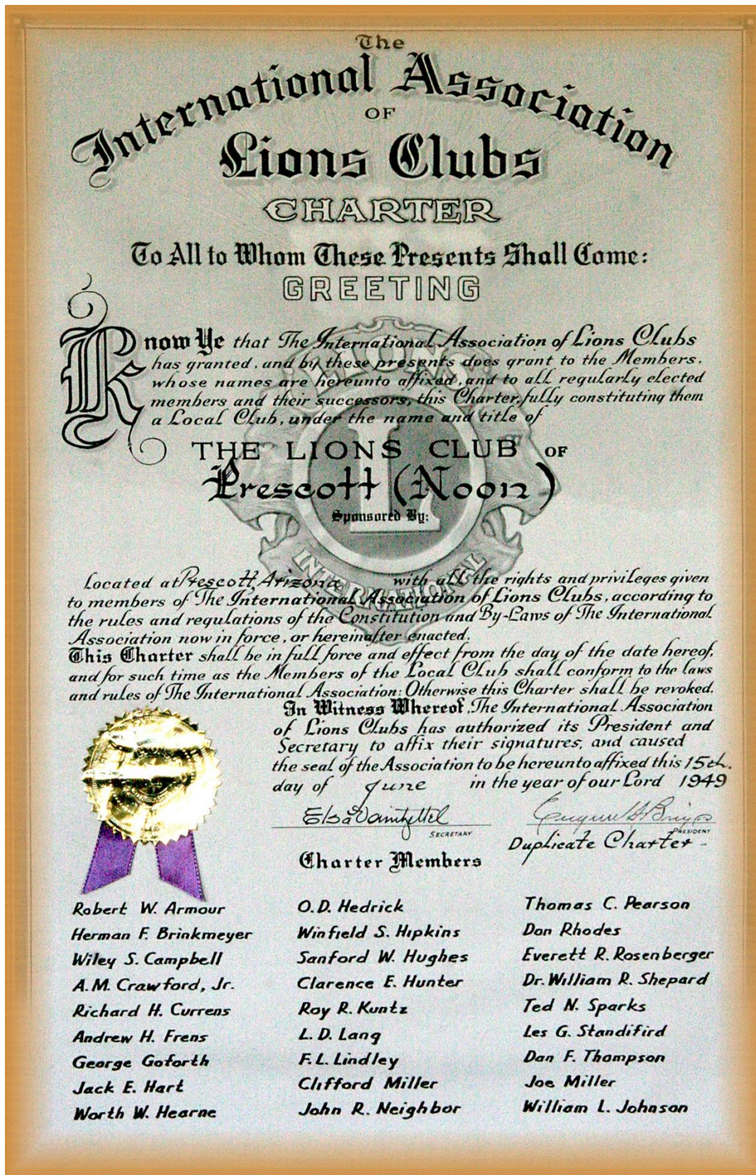
Figure 2-1: Prescott Noon Lions Charter